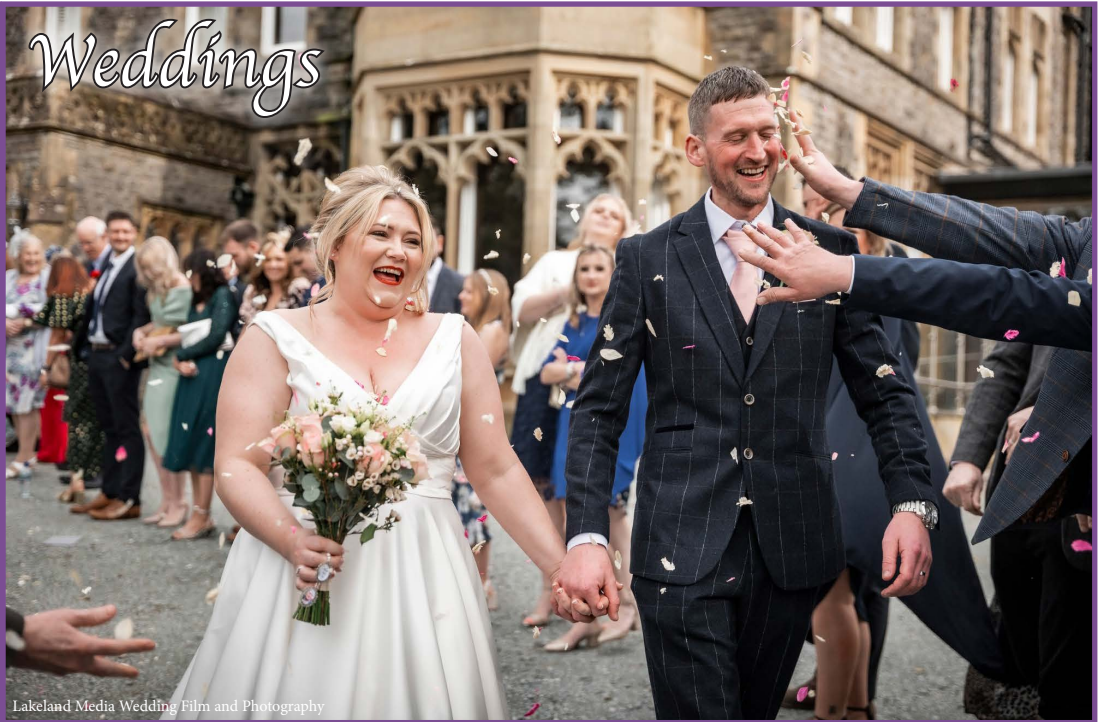
Lakeland Media Wedding Film and Photography