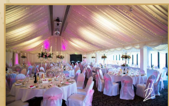
H2 Photography and Film

THE PAVILION IS THE SUPERB FUNCTION SUITE AT THE VILLA, AN IDEAL VENUE FOR ALL EVENTS CATERING FOR UP TO 250 GUESTS. BOASTING A FANTASTIC STATE-OF-THE-ART SOUND CEILING, AT THE PAVILION YOU GET ALL THE ATMOSPHERE OF A DISCO ON THE DANCE FLOOR AND THE ABILITY TO CHAT AND BE HEARD AT YOUR TABLE - OR THE BAR! THE PAVILION HOSTS AN ECLECTIC MIX OF EVENTS FROM WEDDINGS AND FAMILY CELEBRATIONS TO CHARITY BALLS AND LADIES' LUNCHEONS. IT IS CONVENIENTLY SELF-CONTAINED WITH ITS OWN BAR, STAGE AREA AND DANCE FLOOR, IDEAL FOR WEDDINGS OR PRIVATE EVENTS AND CONFERENCES. THE PAVILION ALSO FEATURES AN OUTSIDE SEATING TERRACE.